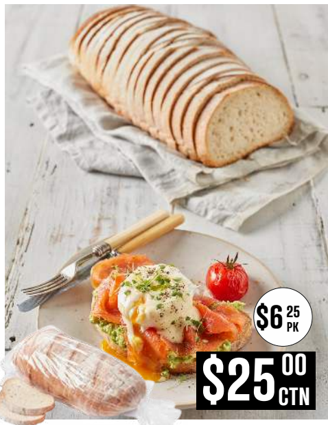
17318 Bread - Sourdough Cafe Sliced Loaf 900g X 4 F