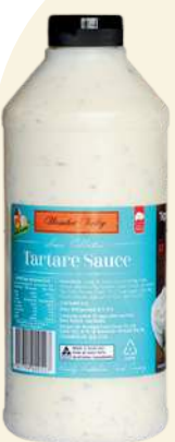
$8 80 UNIT 70627 Tartare Sauce 1kg (6)