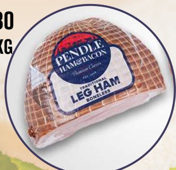
10761 Traditional Half Leg Ham B/less 2.5kg (5) Pendle