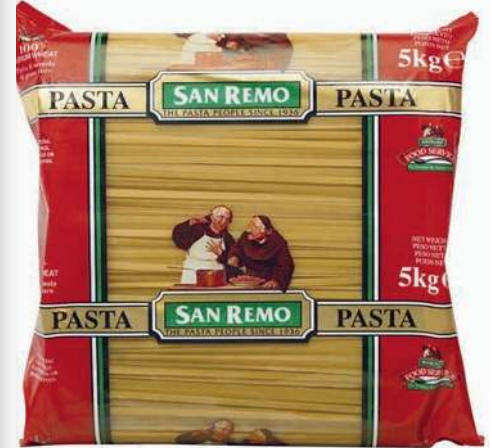
No. 12698 PASTA - FETTUCCINE # 12 2x5KG SAN REMO