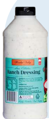
$8 80 UNIT 70621 Ranch Dressing 1kg (6)