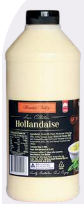
$8 80 UNIT 70628 Hollandaise 1kg (6)