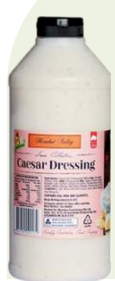
$8 80 UNIT 70620 Caesar Dressing 1kg (6)