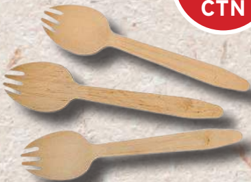
No. 27936 SPORK - WOODEN 165X34X1.5MM 2000'S