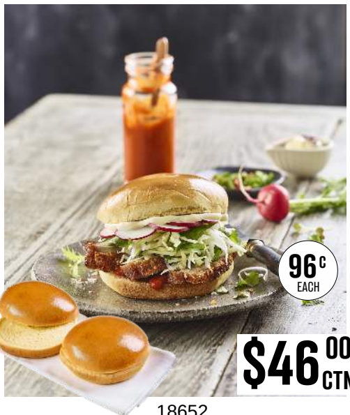
18652 Brioche Burger Bun Sliced Fb 4.5" 100g X 48 F