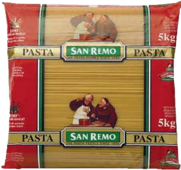
No. 12697 PASTA - SPAGHETTI # 5 2x5KG SAN REMO