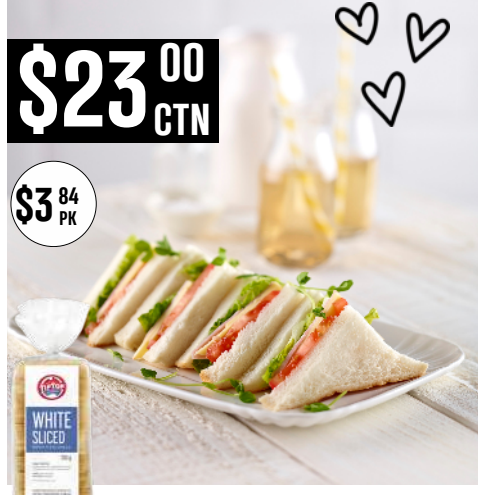
15065 Bread - White Sliced 700g X6 F