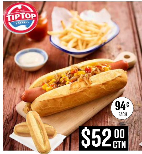
13685 Bread - 8" Brioche Style Gourmet Hot Dog 115g/Pc 55 Pcs/Ctn F