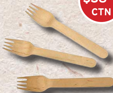
No. 27577 FORK - WOODEN 160X26X1.5MM 2000'S