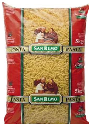
No. 12701 PASTA - SPIRALS/ TRIVELLE # 17 2*5KG SAN REMO