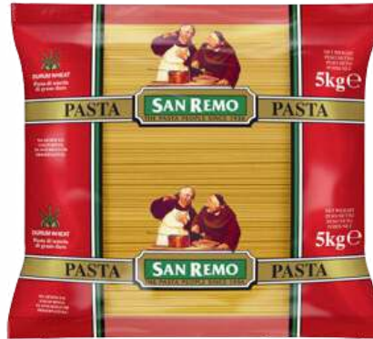
No. 19200 PASTA - LINGUINE 2*5KG SAN REMO