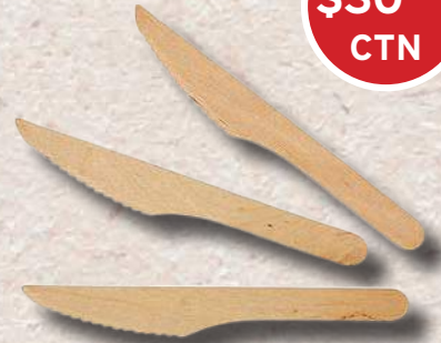
No. 27578 KNIVES - WOODEN 165X22X1.5MM 2000'S