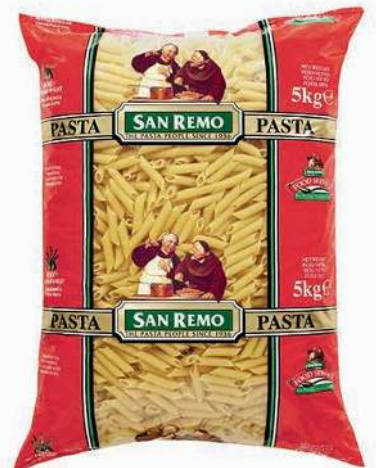
No. 12696 PASTA - PENNE # 18 2x5KG SAN REMO