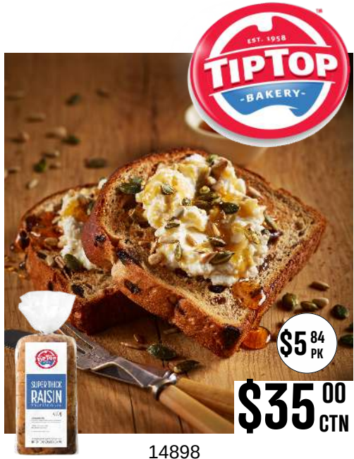
14898 Bread - Super Thick Raisin 650g X6 F