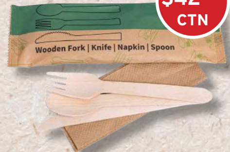
No. 16490 WOODEN CUTLERY SET - FORK / KNIFE / NAPKIN / SPOON 400'S EJ ECO