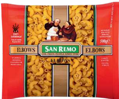
No. 12699 PASTA - ELBOWS # 35 2*5KG SAN REMO