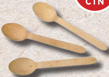
No.27576 SPOON - WOODEN 160X34X1.5MM 2000'S