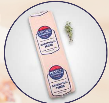
10767 Sandwich Ham 4 X 4kg (5) R/W Pendle