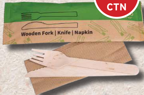
No. 16489 WOODEN CUTLERY SET - FORK / KNIFE / NAPKIN 400'S EJ ECO