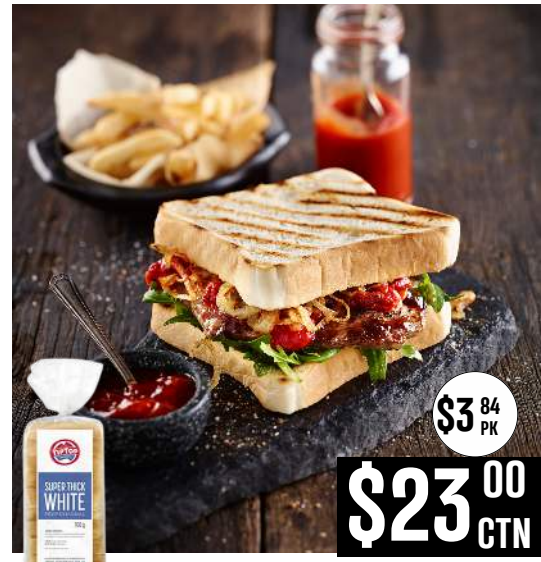
13570 Bread - Super Thick White 700g X6 F