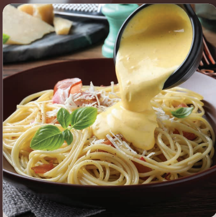
No. 13617 CHEESE - CHEESE SAUCE 1KG (5) DIROSSI