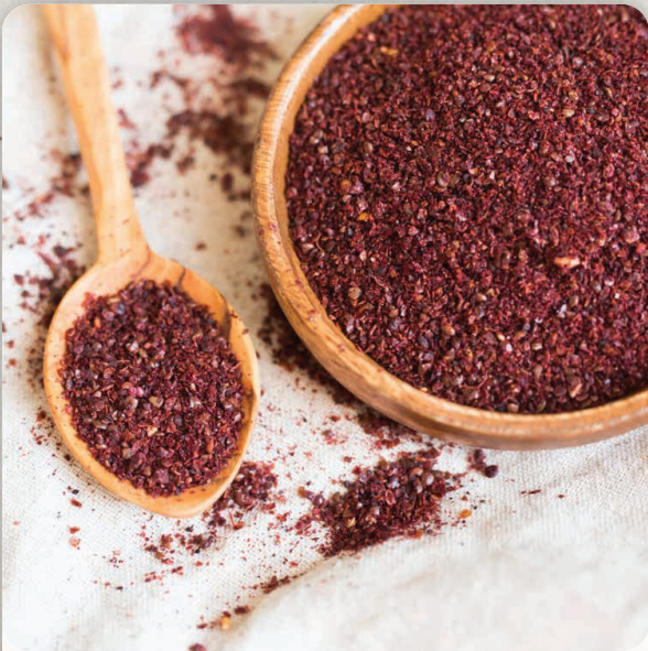
No. 28430 SPICE - SUMAC 1KG KRIO