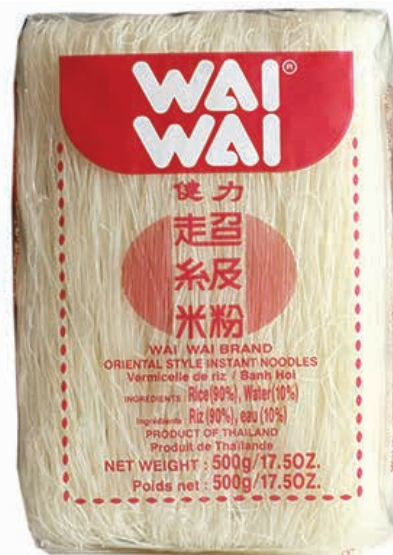
No. 12371 RICE VERMICELLI NOODLES 500G(24) WAI WAI