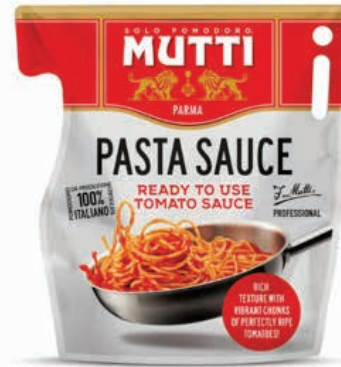
No. 17906 SAUCE - NAPOLI / PASTA SAUCE 3X3KG MUTTI