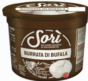
No. 13868 FZ CHEESE - BUFFALO BUR- RATA 125G X 12 SORI