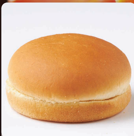
No. 13942 FZ POTATO BUN SLICED 80gX48 ARYZTA