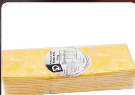
No. 18644 CHEESE - AMERICAN BURGER SLICE 72'S 89X89 1.5KG (8) DIROSSI