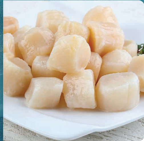
No. 13477 SCALLOPS ROE OFF 60/80 1KG(10) FROZEN