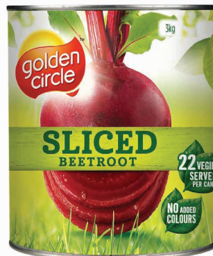
No. 26504 CANNED - BEETROOT SLICES 3KG (3) GOLDEN CIRCLE