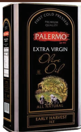
No. 18286 OIL - OLIVE EXTRA VIRGIN 4LTR (4) PALERMO