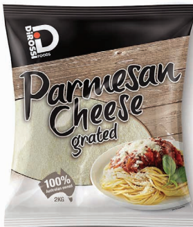
No. 30514 CHEESE - PARMESAN GRATED 2KG(6) DIROSSI