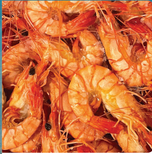
No. 12687 FZ COOKED FARMED TIGER PRAWNS 16/20 AUSTRALIA PACIFIC REEF 3KG