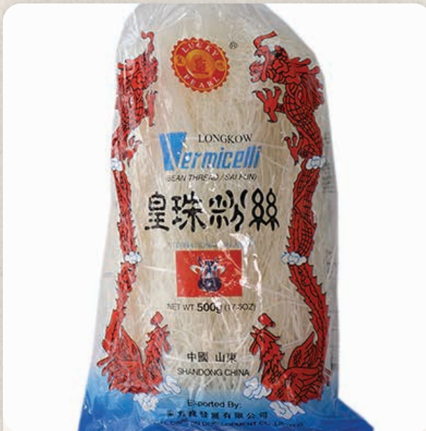
No. 13467 BEAN VERMICELLI 500G(20) LONG KOW