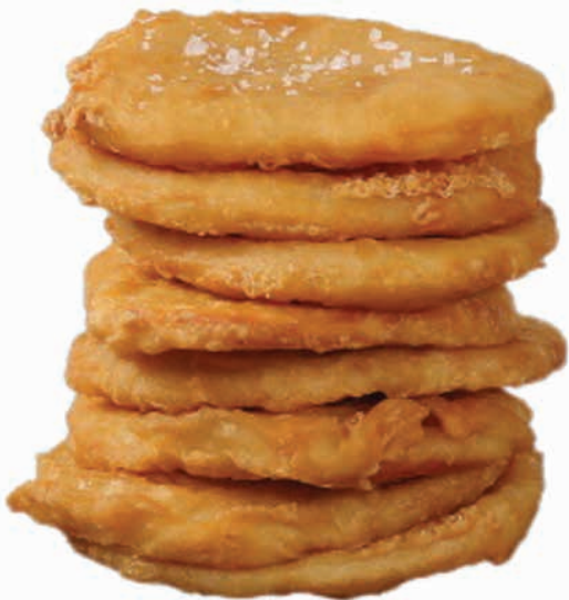
No. 18408 FZ POTATO CAKE/SCALLOP LARGE PREMIUM 70G 120'S AUSSIE CHIPS