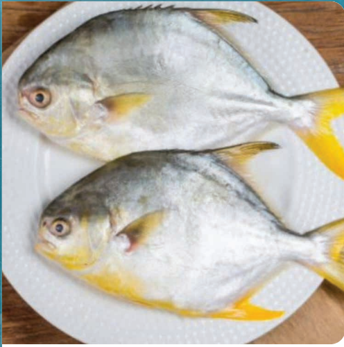
No. 11241 POMPANO 600/7009 GG 10KG/CTN