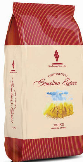
No. 12385 COURSE SEMOLINA 12.5KG BEN FURNEY