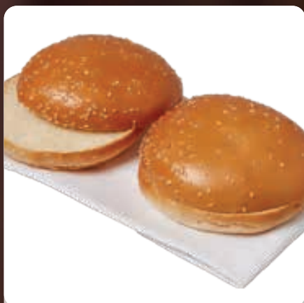
No. 18652 FZ BRIOCHE BURGER BUN FB 4.5" 100G X 48 TIP TOP