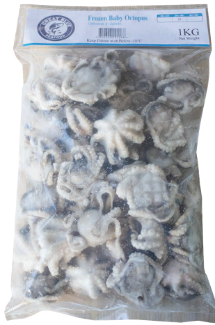
No. 16550 FZ OCTOPUS - BABY IQF 26/30 1KG (10)