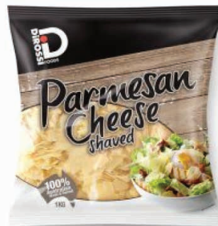
No. 17693 CHEESE - PARMESAN SHAVED 1KG (8) DIROSSI