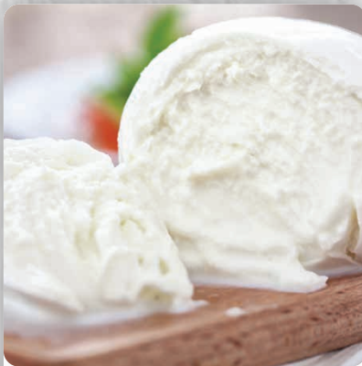
No. 16146 FZ MOZZARELLA - BUFFALO 1KG(2) SORI