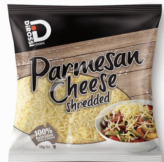
No. 17644 CHEESE - PARMESAN SHRED- DED 1KG (8) DIROSSI