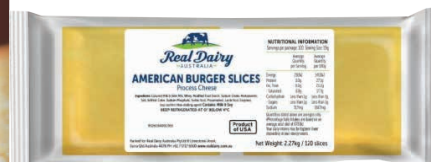
No. 28152 CHEESE - US BURGER SLICES 120'S SLICES 2.27KG (4) REAL DAIRY