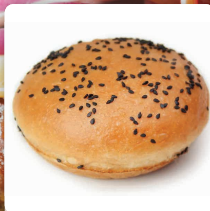
No. 17241 FZ LARGE MILK BUNS SEED- ED SLICED FULLBAKE 24PC 75G BAKERS CRUST