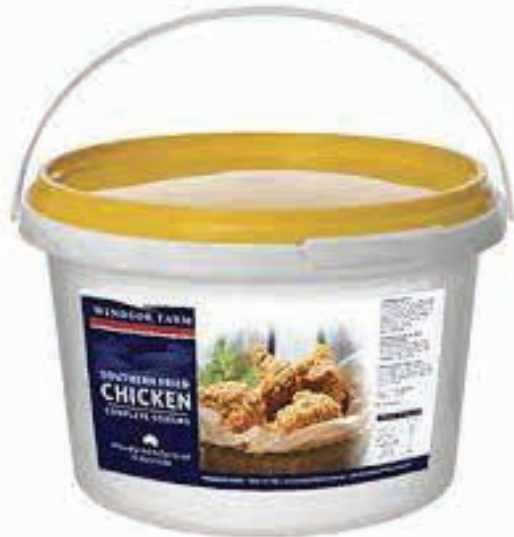
No. 12387 SEASONING - CHICKEN SALT 8KG FRUTEX