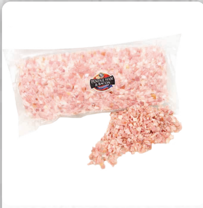
No. 16935 BACON - DICED 2KG (7) PEN- DLE