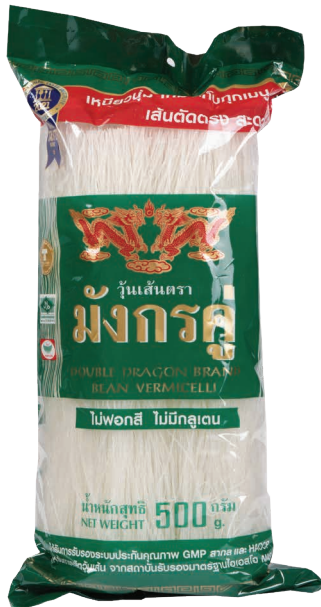
No. 30566 BEAN VERMICELLI 500GM (20) DOUBLE DRAGON