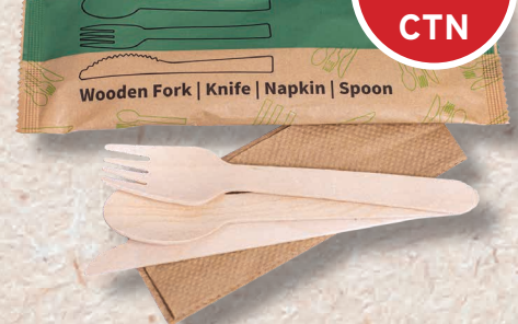
No. 16490 WOODEN CUTLERY SET - FORK / KNIFE / NAPKIN / SPOON 400'S EJ ECO