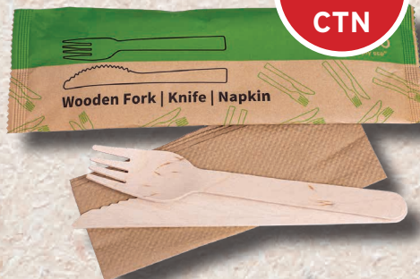
No. 16489 WOODEN CUTLERY SET - FORK / KNIFE / NAPKIN 400'S EJ ECO