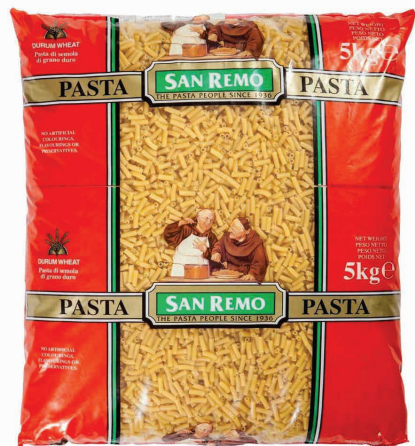
No. 15757 PASTA - MACARONI #38 2x5KG SAN REMO