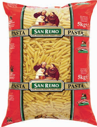
No. 12696 PASTA - PENNE # 18 2x5KG SAN REMO