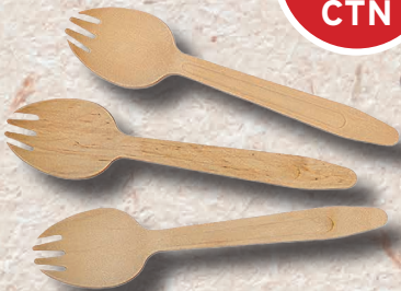
No. 27936 SPORK - WOODEN 165X34X1.5MM 2000'S