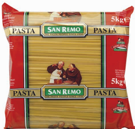
No. 12698 PASTA - FETTUCCINE # 12 2x5KG SAN REMO