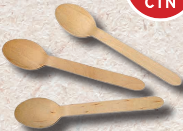
No.27576 SPOON - WOODEN 160X34X1.5MM 2000'S