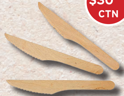
No. 27578 KNIVES - WOODEN 165X22X1.5MM 2000'S