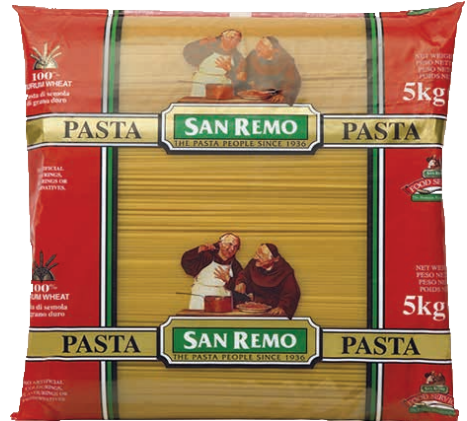
No. 12697 PASTA - SPAGHETTI # 5 2x5KG SAN REMO