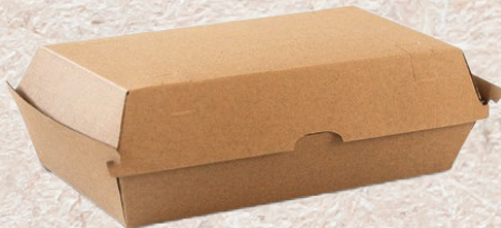
No. 18241 SNACK BOX LARGE HARD CORRUGATED 205x106x76 200'S