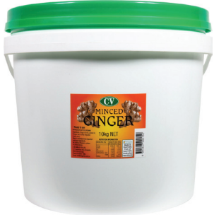
No. 19535 GINGER - MINCED (BULK) 10KG CV