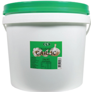
No. 19541 GARLIC - CRUSHED (BULK) 10KG CV