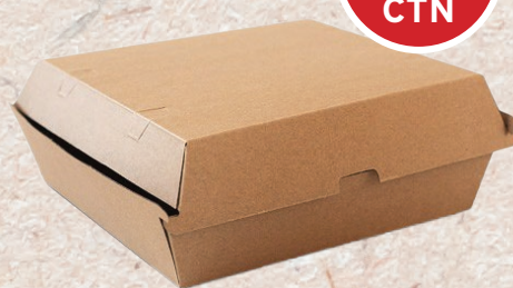
No. 27618 DINNER BOX HARD CORRUGATED 178x160x80 150'S