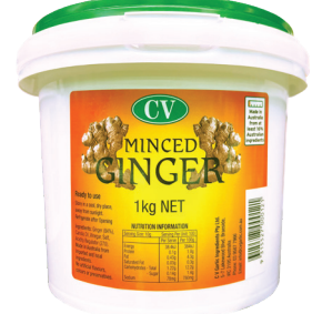
No. 31370 GINGER - CRUSHED 1KG (6) CV