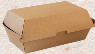
No. 18240 SNACK BOX REGULAR HARD CORRUGATED 176x91x85 200'S