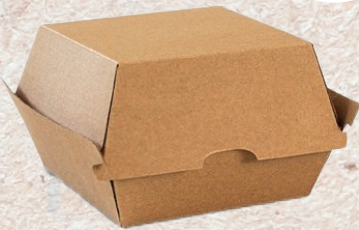
No. 18239 BURGER BOX HARD CORRUGATED 102x105x80 250'S