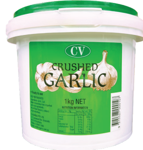
No. 31203 GARLIC - CRUSHED 1KG(6) CV